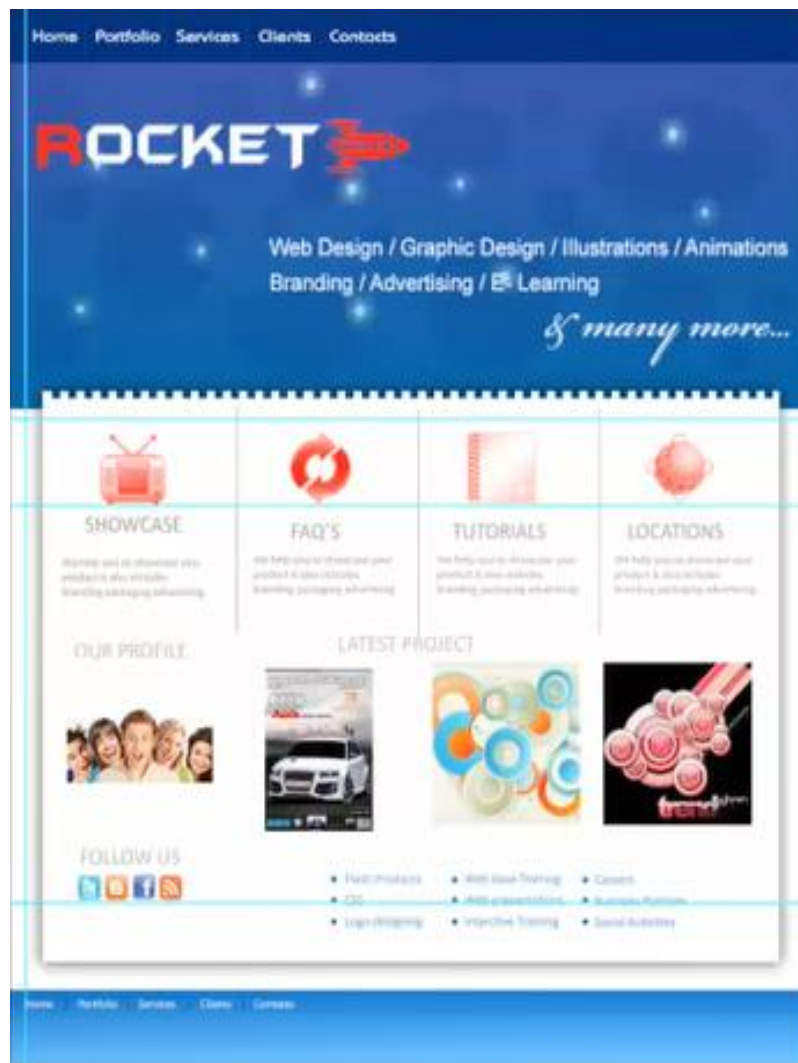
Web Layout Design

Outputs: Web Layout Design, Web Banner, Advertisement, UI Design